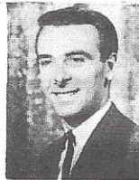
SANDY SHORE 2-6